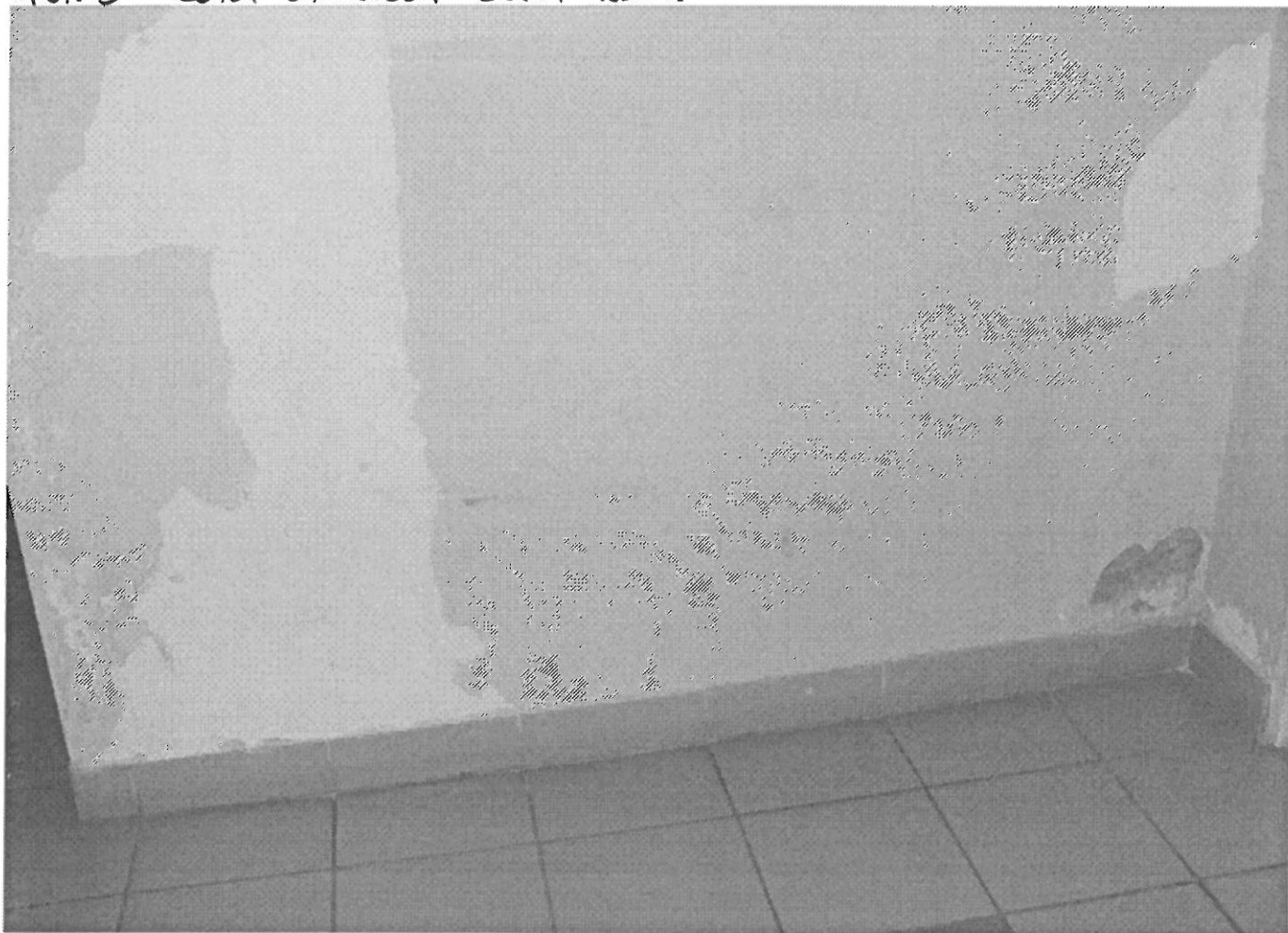
FOT. 4 J-W.